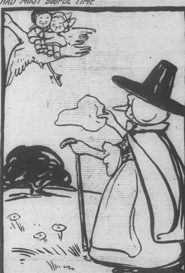
MOTHER GOOSE BID THEM GOODBYE

Bobby and Dolly sat up and rubbed their eyes and looked foo!ishand where do you think they were? Sitting at the little tea table under the very apple tree where Mother Goose's invitation had been delivered to them. My goodness, but they were glad to be home again. And, strange to say, no one had even noticed that they had been away, visiting Mother Goose in Storyland.