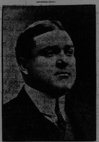
President Ed. Barrow, of the Eastern League, who will likely be re-elected for five years at the annual meeting to be held in New York soon.