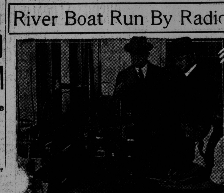
Tug boats in the waters around New York will be taking orders by radio soon. One, shown here, has already been equipped with sending and receiving apparatus, so that the captain may keep in constant touch with the owner. Marine men are shown inspecting the apparatus.