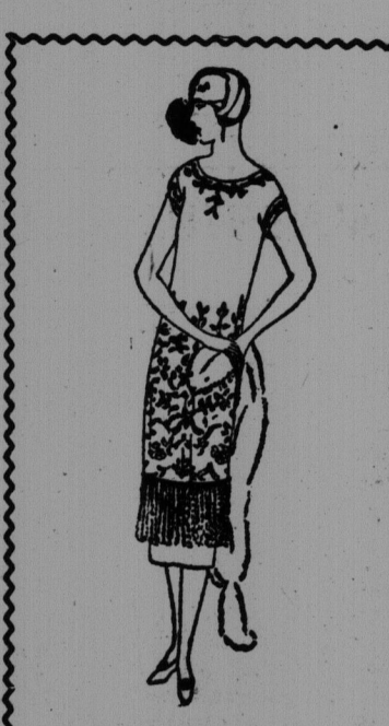
Beautiful Frocks for New Year Social Events

Formal and informal events already in view bring to mind your need for a new frock or two to grace the various occasions.