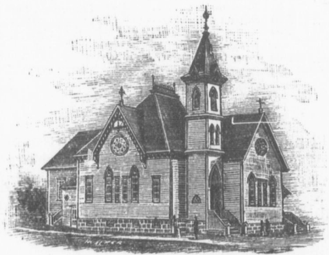
ROUSSY MEMORIAL FRENCH BAPTIST CHURCH, GRANDE-LIGNE, QUE.