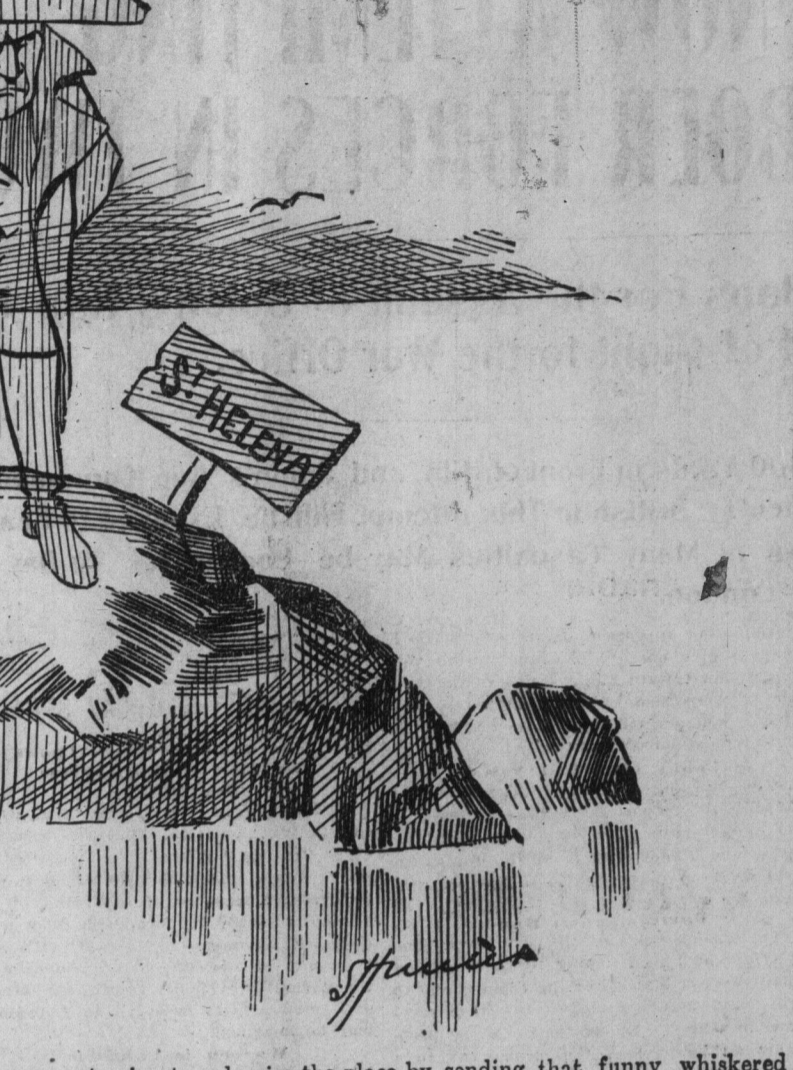
SHADE OF NAPOLEON: I hope they are not going to vulgarize the place by sending that funny whiskered old Dutchman Kruger here.

At the Princess. The Princess Theatre has a very successful season with the musical comedy "The Princess Theatre," which is staged admirably. There has never been a better season at the Princess Theatre since it was opened.