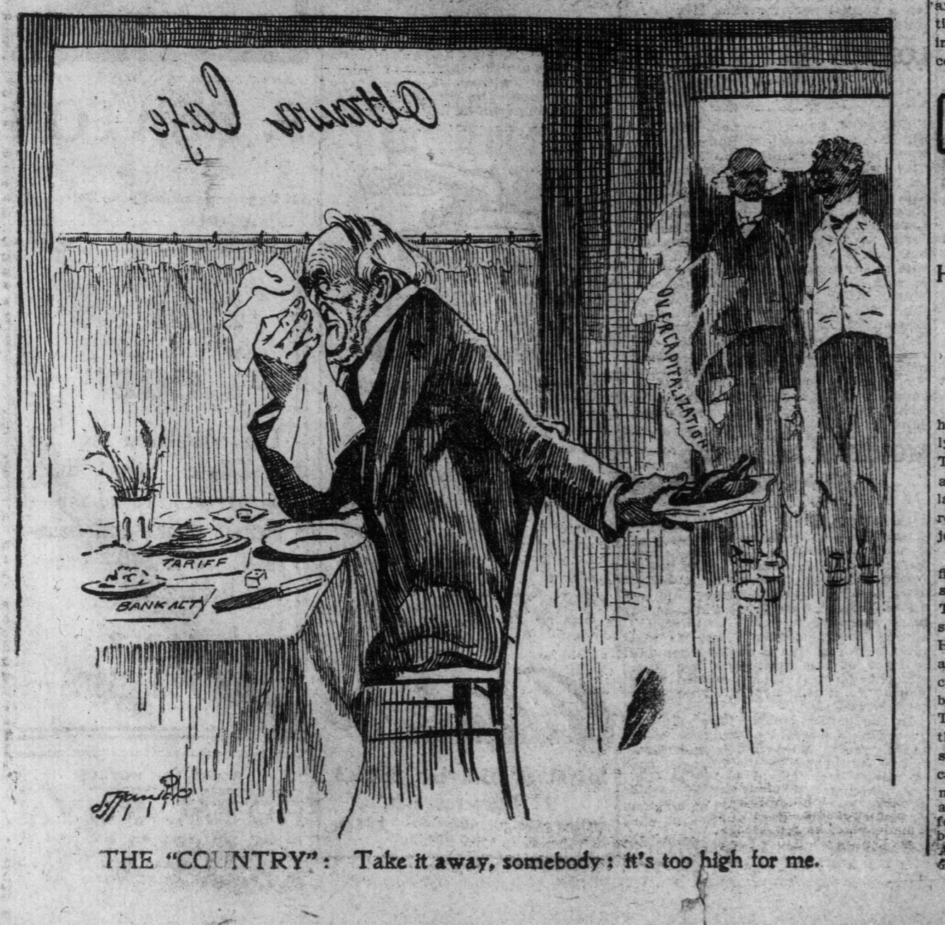
THE "COUNTRY": Take it away, somebody: it's too high for me.

Private corporations are always after these valuable assets, and the government is generally committed to some scheme of other before the people get a chance to express any wish to control them for themselves," said Mr. Pocock in presenting the resolution. "I move this resolution with the hope that it may forestall any contemplated action on the part of the government."