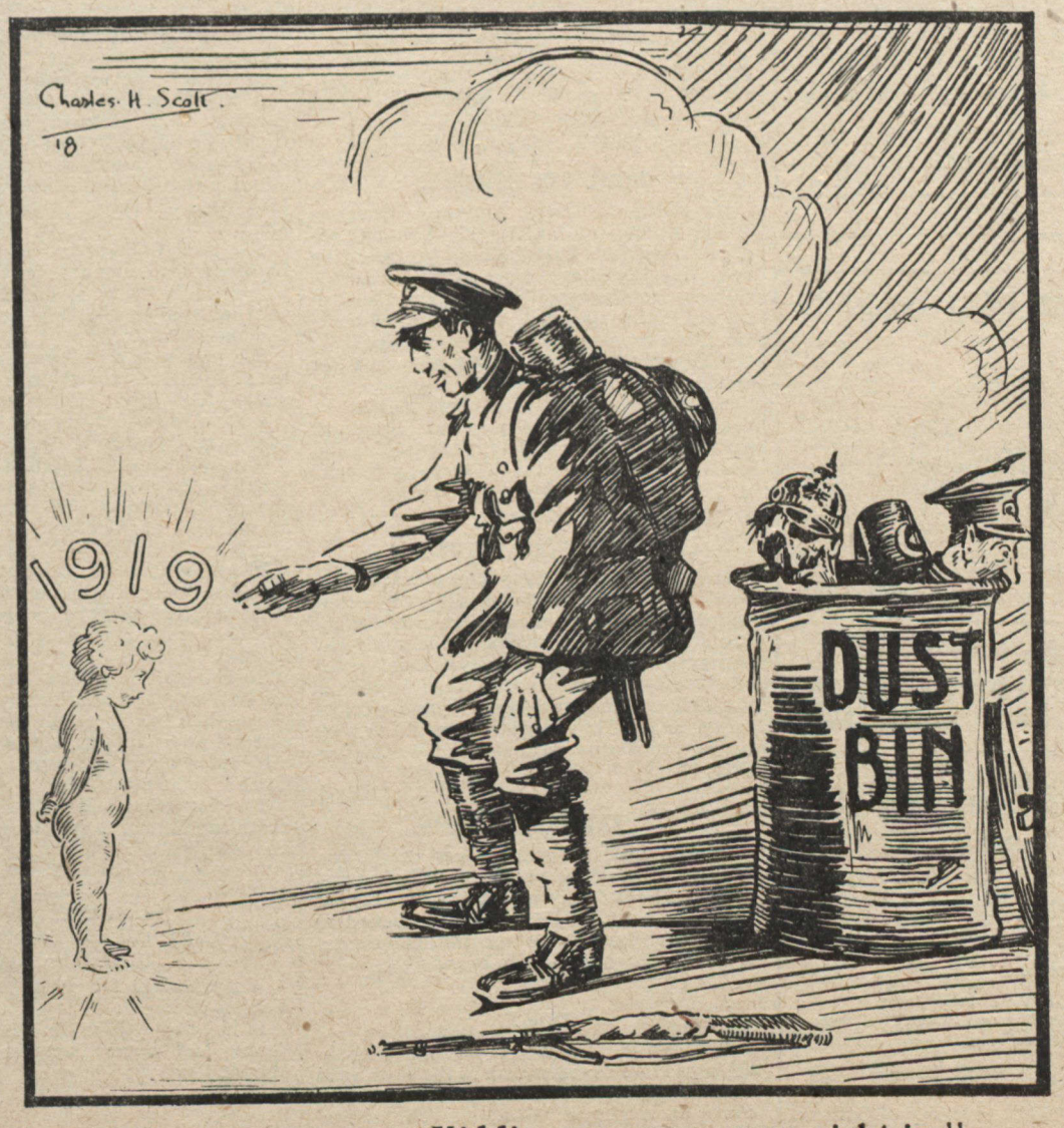
"It's all right now, Kiddie, you may come right in."