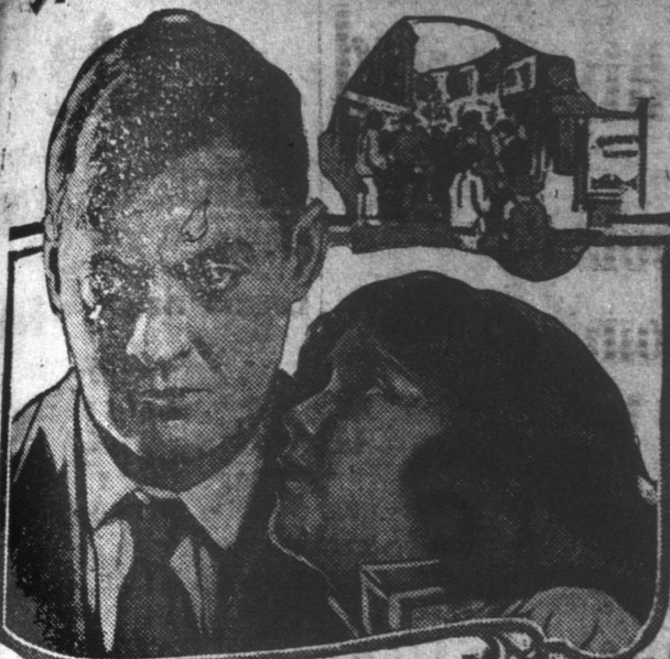
Lionel Barrymore and Miriam Battista in a scene from the Paramount Picture, 'Boomerang Bill'. A Cosmopolitan Production.