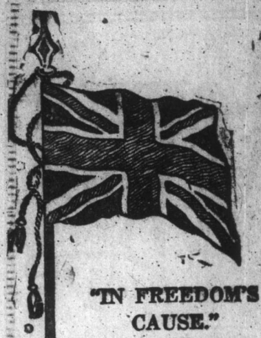
"IN FREEDOM'S CAUSE."