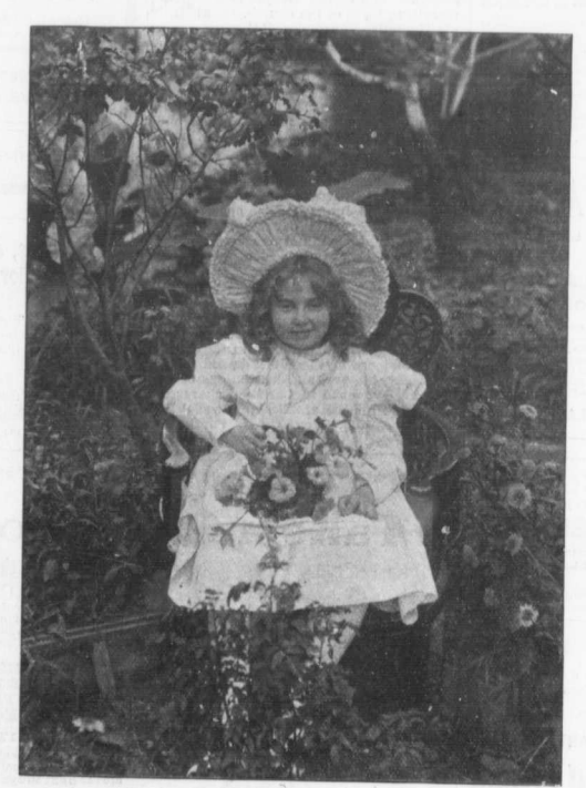
AMONG THE FLOWERS.