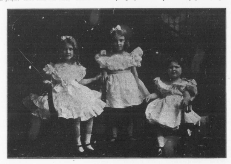
THREE LITTLE MAIDS.

and desirable, it is the thing we ought to expect; it ought to be as common for young children to be born into the kingdom of God as to be born into the world. It is possible and natural for children to be converted at their mother's knee, and never know the time when they did not love the Saviour. And this should not be something rare, occasional, remarkable, a phenomenon, a thing to excite remark. like a comet or a meteor. It should be the usual, expected thing, that children of religious parents should choose to live for the Saviour as early as they are able to make any choice, and should be received into the Church and receive its nurturing, fostering care. The churches and Christian parents at large have had their eyes blinded to this matter. The Church has often said to the children, "You cannot come in here: stand out there in the vestibule until you are grown up"; and a very cold, cheerless vestibule it has often been Or else it has said, "Go to the Sunday-school: that will do for you while you are young." Devout parents have prayed earnestly that their