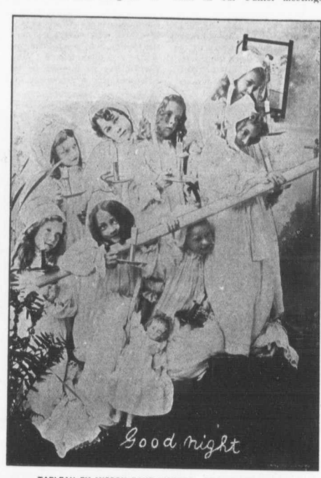
TABLEAU BY MISSON BAND WORKERS OF THE METHODIST

many Juniors have easily distanced their seniors in the service of their Master. The Junior League is not creating little hypocrites. More faithful servants of Jesus Christ cannot be found anywhere than in our Junior meetings. Such