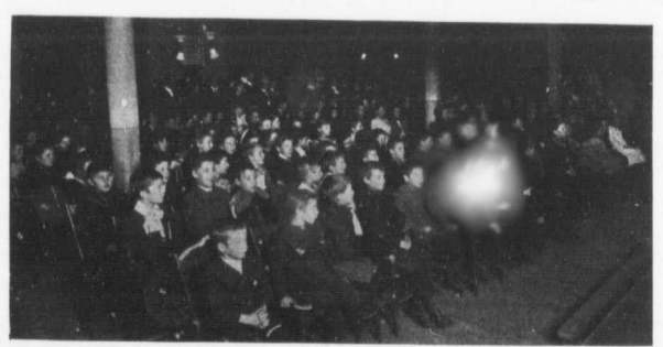
THE FRED VICTOR MISSION JUNIOR LEAGUE.

Most children seem gifted with a power which enables them to look through and through those whom they meet, understanding or feeling that which the adult will never detect. Very quickly they detect sham in the individual and in their own wise way draw their conclusions concerning that lie. Every such lie discovered tends to make them less trustful and trustworthy and has an evil influence which lasts throughout life. On the other hand under the influence of a noble life, the child himself grows noble