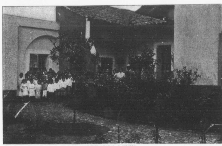
A JUNIOR LEAGUE IN MEXICO.

Junior members should be promoted into the senior society when they reach the age of fifteen or sixteen. Their training in the Junior League will make them more intelligent members of the senior.