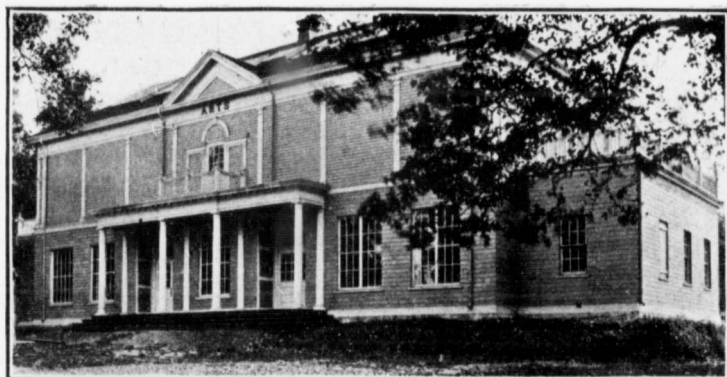
FINE ARTS BUILDING, NOVA SCOTIA PROVINCIAL EXHIBITION.