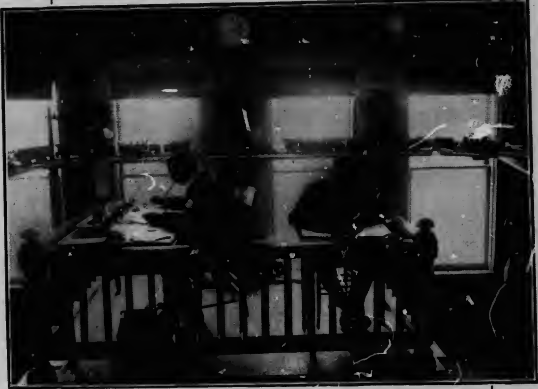
Trein Dispatcher's Office.

This illustrates the Instructor, with a Student Assistant, acting as Train Dispatcher, working with the Senior Class. Having a double-track railway with freight and passenger trains operated from this desk, together with the regular train order forms supplied by the Railways, etc., we guarantee results.