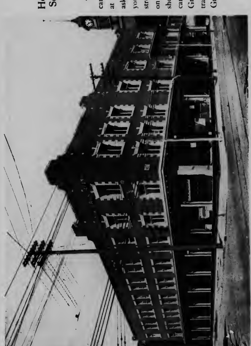
Home of the Deminion School of Telegraphy and Railroading (Cor. Yonge & Grenville Sts.), Toronto, Ont.