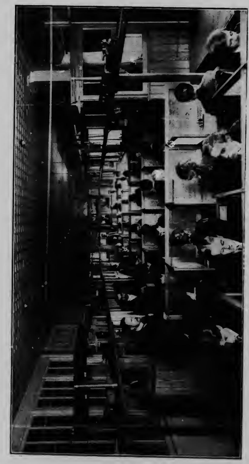
Another View of Senior Department, showing Stations on the Miniature Railroad.