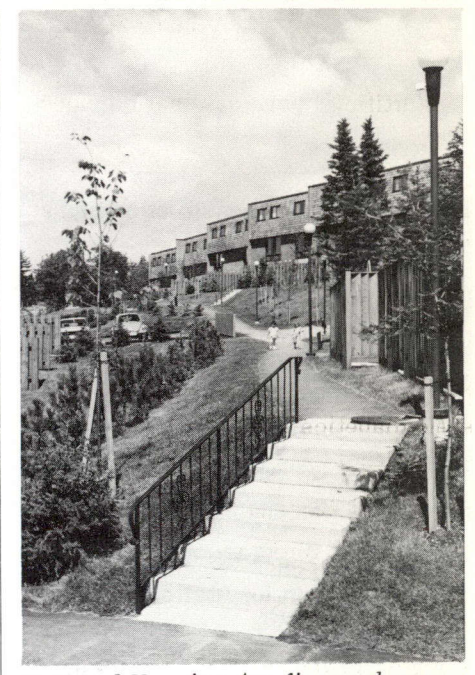
National Housing Act-financed condominium complex, Halifax, N.S.

The average family income of NHA borrowers climbed to $12,856 in 1973, an increase of almost 9 percent over that of the previous year. This compares to an estimated average income for all families of $11,383 in 1973. The proportion of NHA borrowers drawn from the lower third income group fell to 25.0 per cent from 29.2 per cent in 1972.