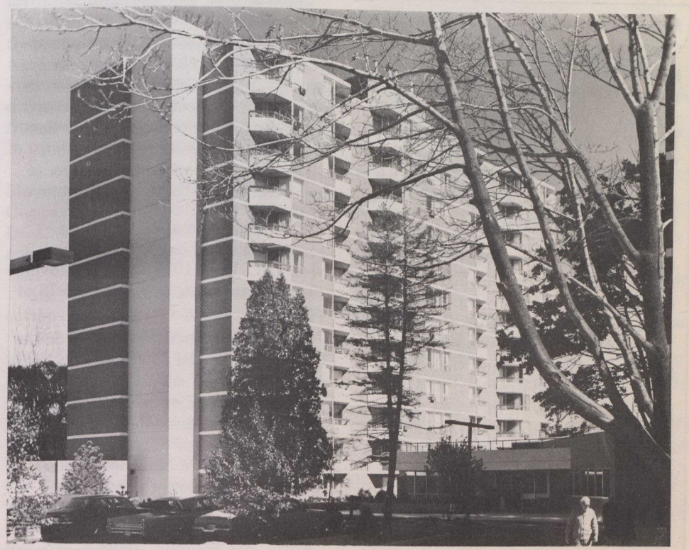
Senior citizens' apartment, Oakville, Ontario, financed under the NHA.

The initial results have been most encouraging. From the time the new programs became available, until the end of 1973, the Corporation was able to commit over $130 million in loans to