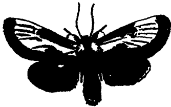
Colors, creamy white and brownish purple

along the anterior edge, reaching from the base to a little beyond the middle of the wing. On the outer margin is a broad band of the same hue, widening posteriorly, with a wavy white line running through it, composed of minute pearly dots or scales. It is bordered internally with dull deep green. The brownish purple band is continued along the hinder edge, but it is much narrower here and terminates a little before it reaches the base. There are also two brown spots, one round, the other reniform, near the middle of the wing, often so suffused with pearly white scales as to be indistinct above, but clear and striking on the under side.