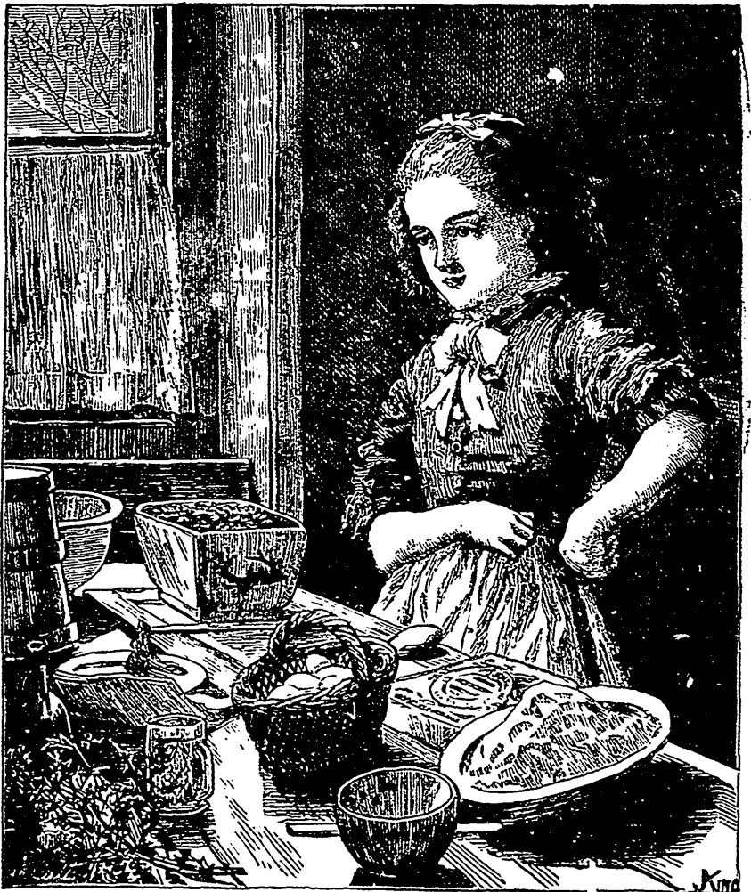
THE YOUNG HOUSEKEEPER.

"Oh, yes, mamma, I can do it first rate," said Maud, and she rolled up her sleeves and tied on an apron and set to work. She got the eggs and butter and flour, and I don't know what else, and in a short time had quite a nice dinner ready. Not only did she relieve the mind of her sick mamma of a great care, but she greatly pleased her papa