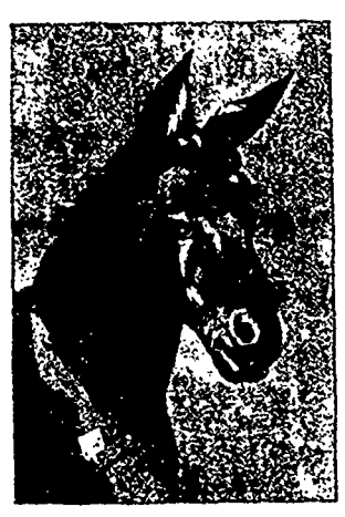
THE CHRONIC "KICKER."