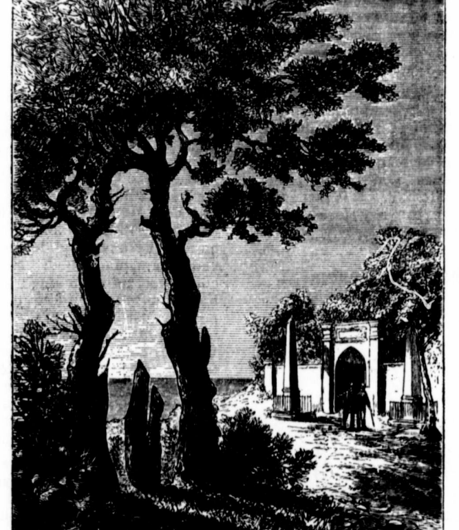
TOMB AND SHADE OF WASHINGTON.

So is it, dear children, with the Bible. Christ, the Spotless One, is the grand centre figure. But | crown of glory that fadeth not away.