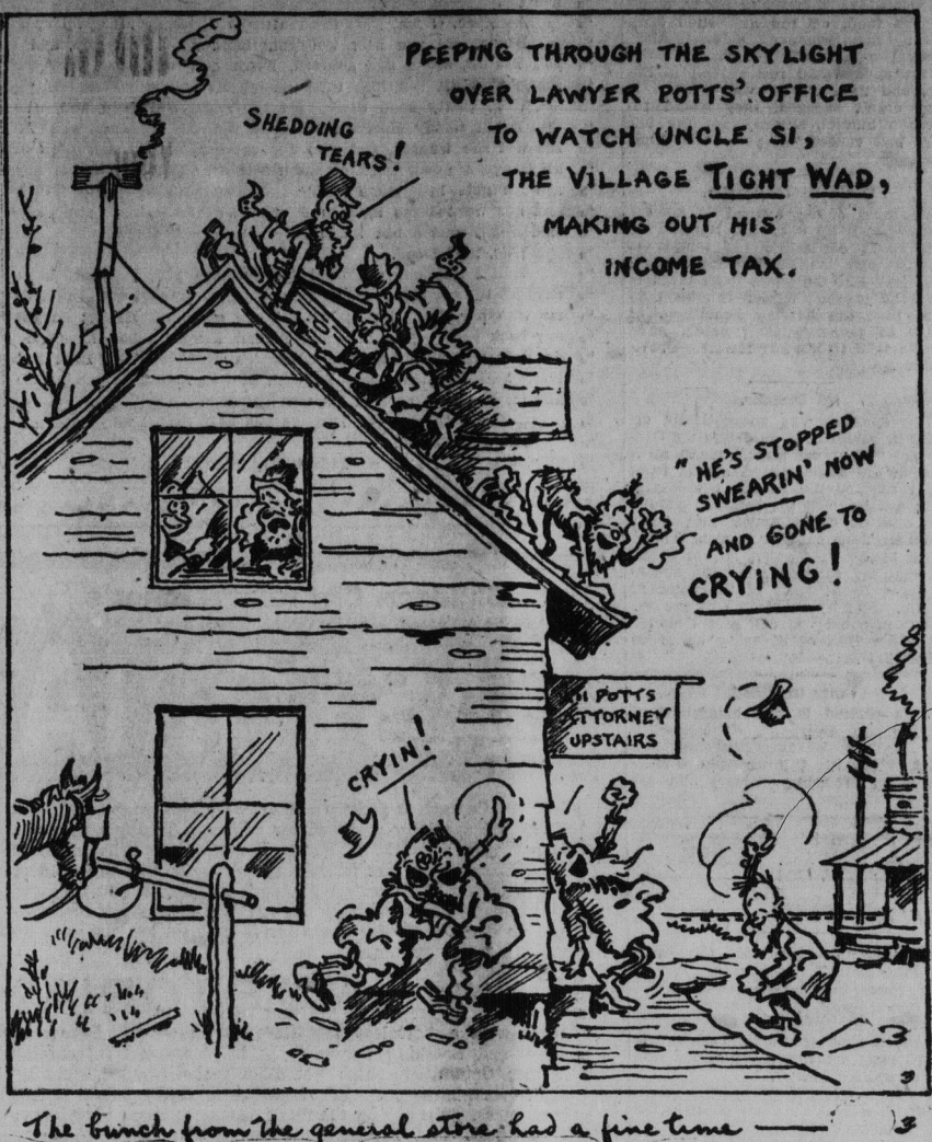
The bunch from the general at the farm had a fine time

Farm Settlers. There were offices of the board in the provinces of Canada, the New Brunswick office being at St. John.