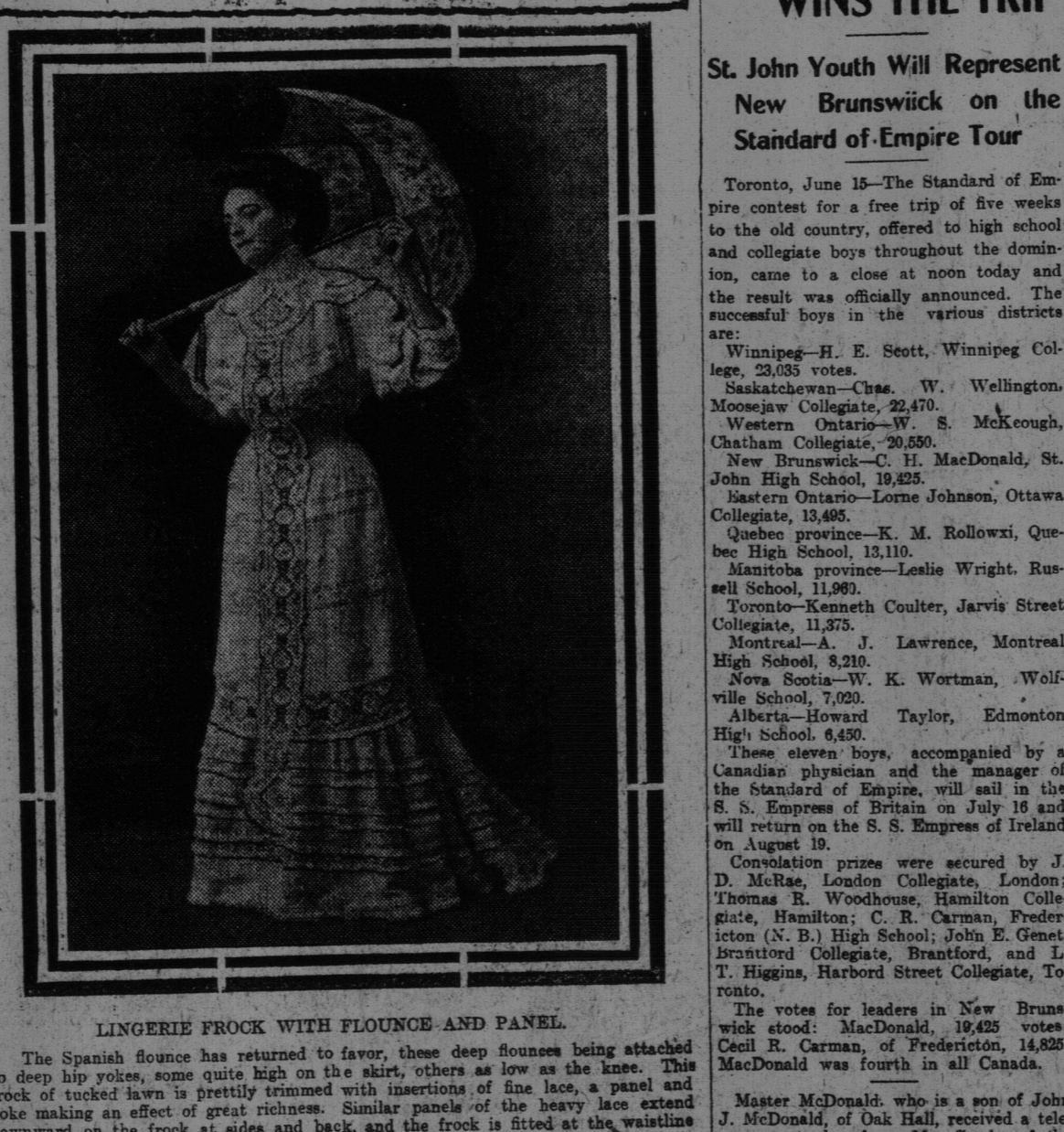
LINGERIE FROCK WITH FLOUNCE AND PANEL.

The Spanish flounce has returned to favor, these deep flounces being attached to deep hip yokes, some quite high on the skirt, others as low as the knee. This frock of tucked lawn is prettily trimmed with insertions of lace, a panel and yoke making an effect of gray richness. Similar panels of the heavy lace extend downward on the frock at sides and back, and the frock is fitted at the waistline by means of very fine pin tucks.