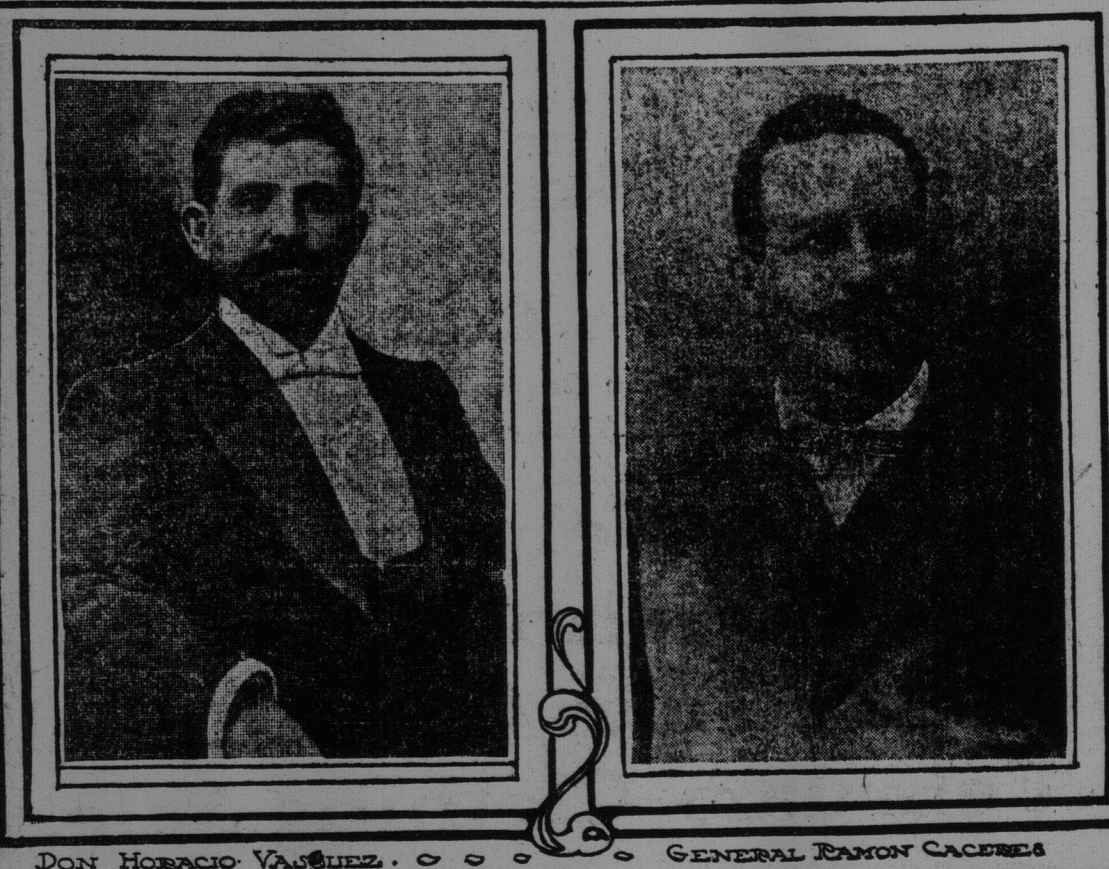
DON HORACIO VASQUEZ. GENERAL RAMON CACERES

Sancti Spiritus, Santo Domingo, Jan. 28.—General Caceres' friends are surprised to learn that he objects to serving out President Morales' unexpired term and proposes to call an election so that a new president may be inaugurated on Feb. 27, the Independence Day of the republic, when the chamber of deputies will meet.