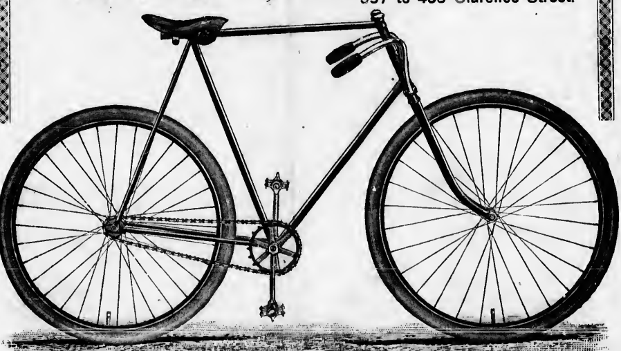
SMALLEY'S TRACK RACER-19 Pounds.

W. MANN & CO., 397 to 403 Clarence Street.