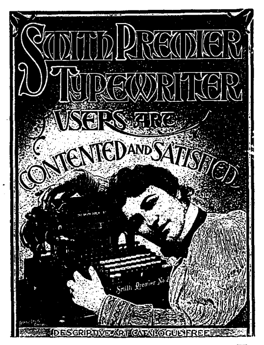
NEWSOME @ GILBERT Sole Dealers TORONTO

THE MANUFACTURERS LIFE INSURANCE. HEAD OFFICE - TORONTO.