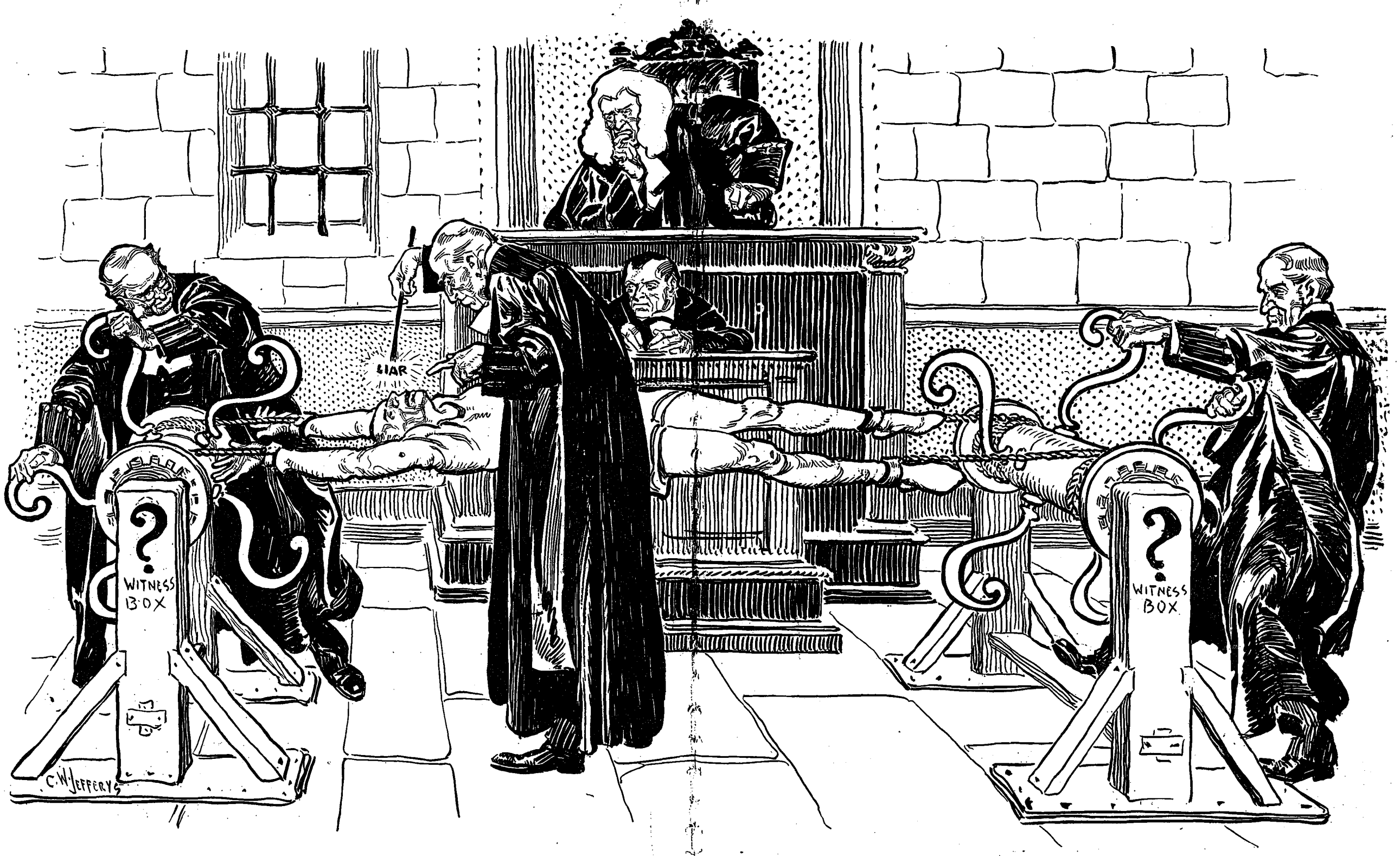
The Modern Trture Chamber.