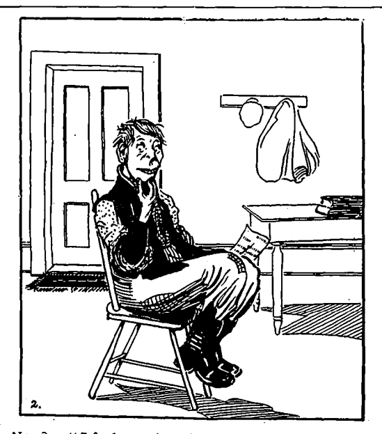
No. 2.—"I feel a strange interest in you, and therefore write you this personal letter, giving you a chance to take advantage of our marvelous course of reading, which is sure to make you a great hypnotist. You have those rare qualities possessed by but few mortals."—Always told Dad that he ought t' send me to bisiness college.

maintenance, is unearned. Realizing this fully, we have decided to establish "The Rights of Labor," and, until we can get ourselves more fully established, we must contract for the printing of it and would like to get your price per thousand copies. Oh, your price is too high, far too high. What? Pay union wages? Men are expensive and must get good pay? That's all right, when they can get it, but they won't get it out of us. Oh, that's all right, if you must have your price, why you must, but you don't have to print our paper. No, sir! We are not such spring chickens as to pay the first grasping monopolist that we meet his price because he asks it. If we can't get prices right, we will hire a plant and employ apprentices and girls. With a good, sharp foreman, who is well paid, we can get more work out of girls for less wages than out of the best journeymen going. We are not in this thing just for our health, and we would not pay you or anyone else one dollar for work that we can get done for forty cents. A girl don't need as much pay as a man, for they can live cheap, and it would be only encouraging