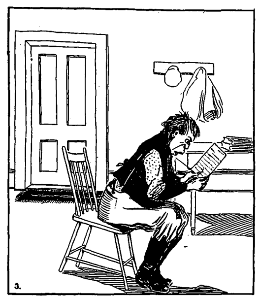
No. 3.—"A golden future awaits you; you will succeed. Don't fail to accept this last chance to become a master mind. For the sake of developing your miraculous, but dormant, powers, I am going to give you our complete $40.00 course for the ridiculously low sum of $4.00, if you will keep it a secret. Write to-day."