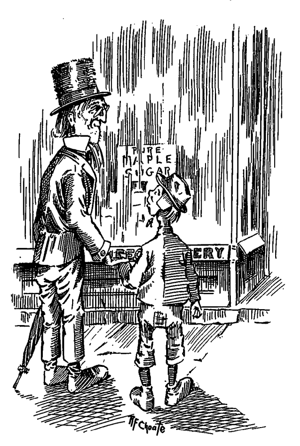
An Effectual Meuse-stopper.