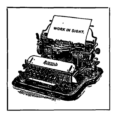
IT IS THE BEST

Because it does the GREATEST VARIETY of the BEST TYPEWRITING for the LONGEST TIME with the LEAST EFFORT.