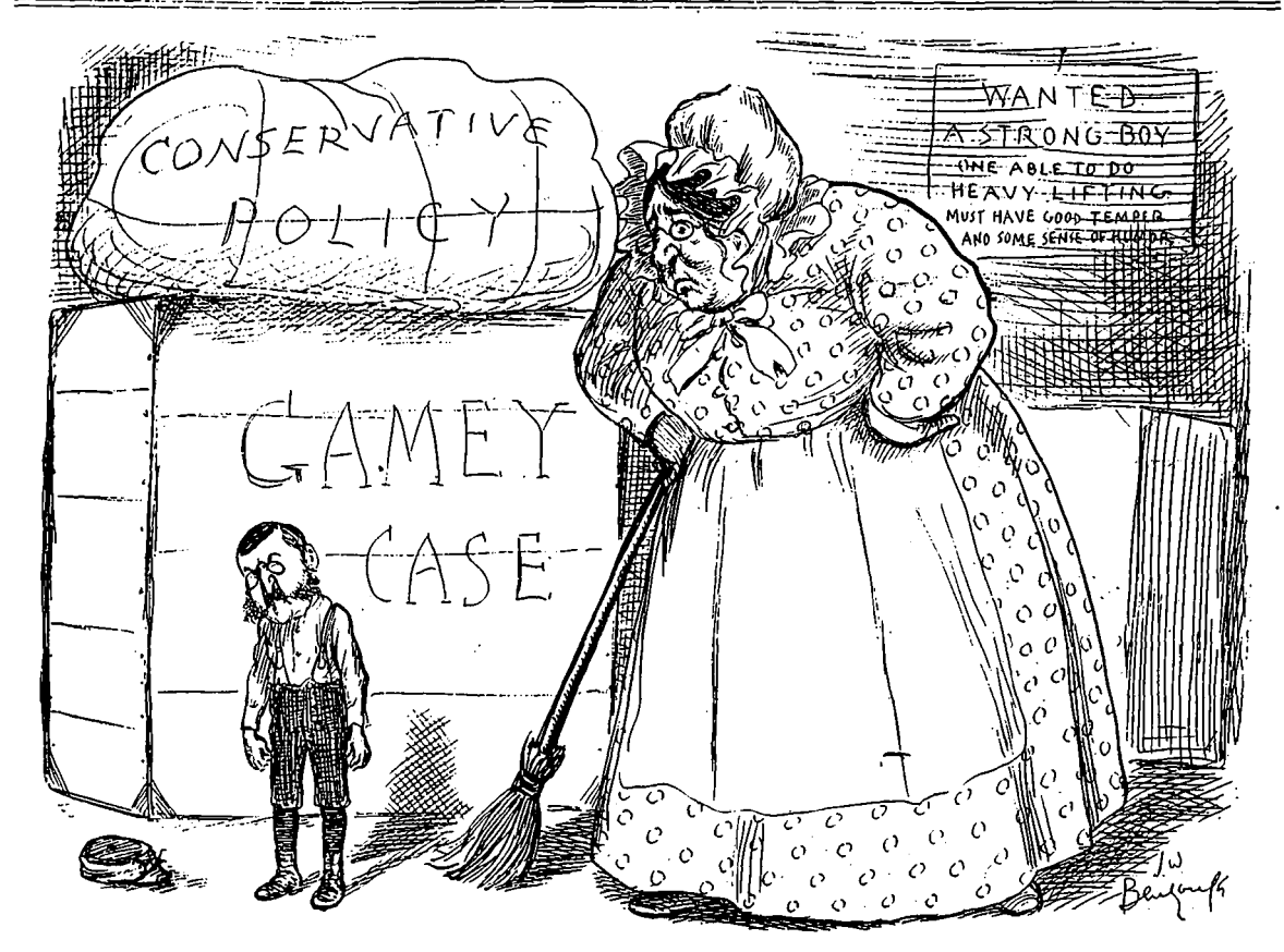
Too Light for the Place.

The Tory Party: "Jimmy, I'm afraid you won't do. You are not big enough to handle such a case, or to carry out the bundle, and your temper is just a little too waspish."