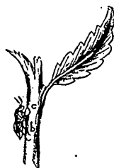
FIG. 1.—Side view, natural size.

The "stinging bug" (Fig. 1) is somewhat jagged in appearance, about three-eighths of an inch long, and generally of a yellow color, though