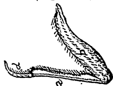
FIG. 8—Middle Leg—much magnified.

toothed, while the latter is greatly enlarged. From the interior lower aspect of the femur (Fig. 6) is the small tibia, while on the lower edge of the tarsus (Fig. 6, d) is a cavity in which rests the single claw. The other four legs (Fig. 7) are much as usual.