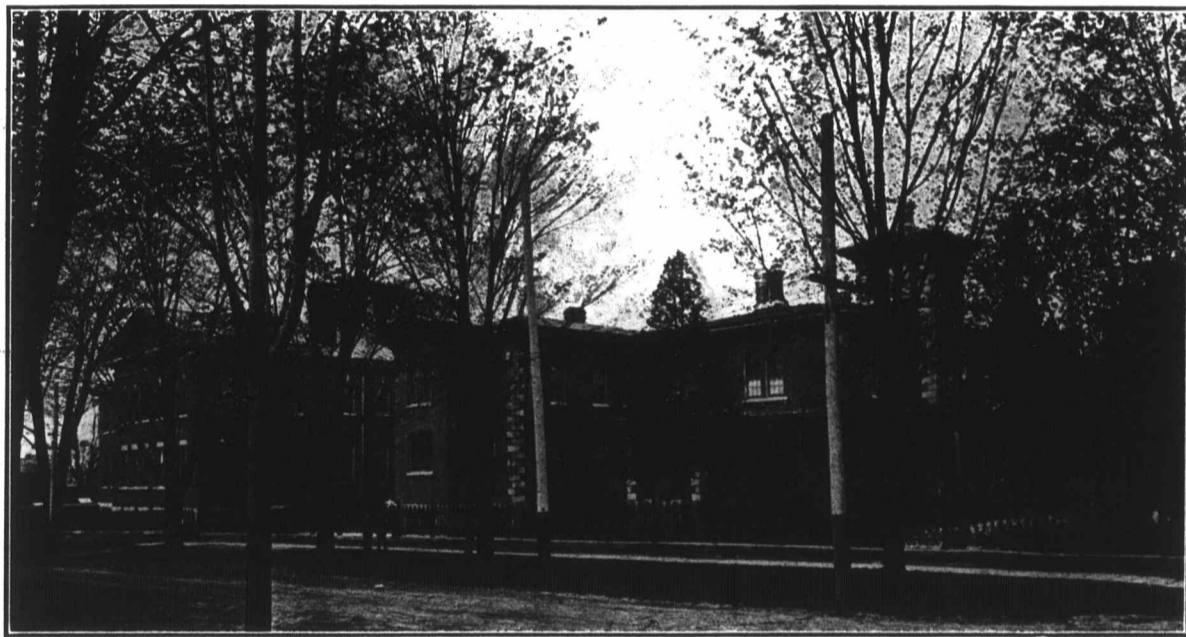
The Canadian Churchman.