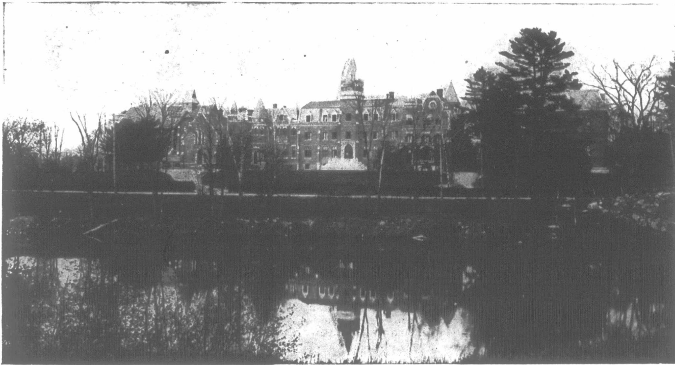
The Canadian Churchman.