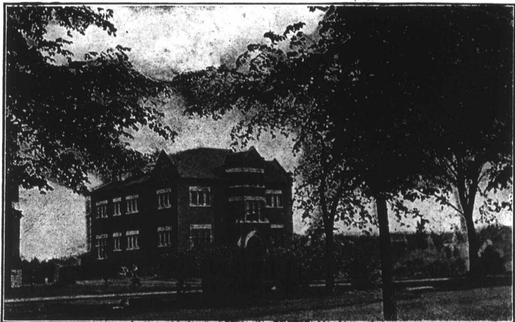
The Canadian Churchman.