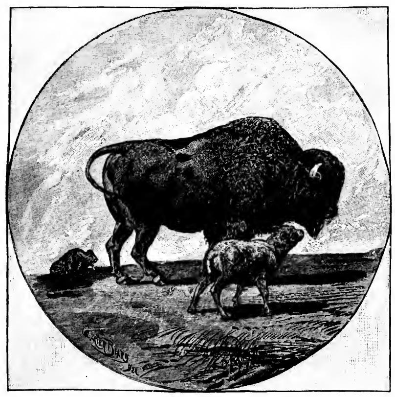
THE MONARCH OF THE WEST,

round them we could see women, lads and children, lazily watching the train. Some "coyooses," as they call the Indian ponies, were browsing close at hand. Then the train would run into a station, and we would see a dozen or perhaps a score of Indian braves and squaws in their gay blankets and paint-daubed faces, all hurrying up at a dog trot to board the cars when they should stop. The women