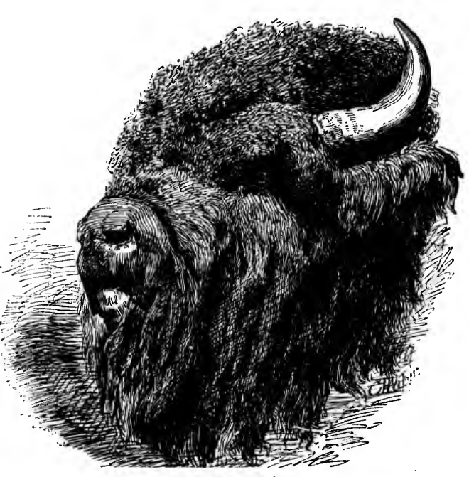
WHO GORS THERE? Reproduced from Outing, Vol. VIII., page 322.