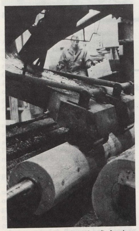
Huge lathe peels a Douglas fir log into sheets of veneer for Canfor plywood. The Canfor Group of companies — Canadian Forest Products Ltd. and its affiliates — is based in Vancouver, British Columbia.

nounced last August. Mr. Andras said that the Federal Government now wanted to: re-examine existing forest-management agreements with the provinces to upgrade them in light of the new push to modernize plants and machinery; and invite British Columbia and other interested provinces to enter into similar agreements.