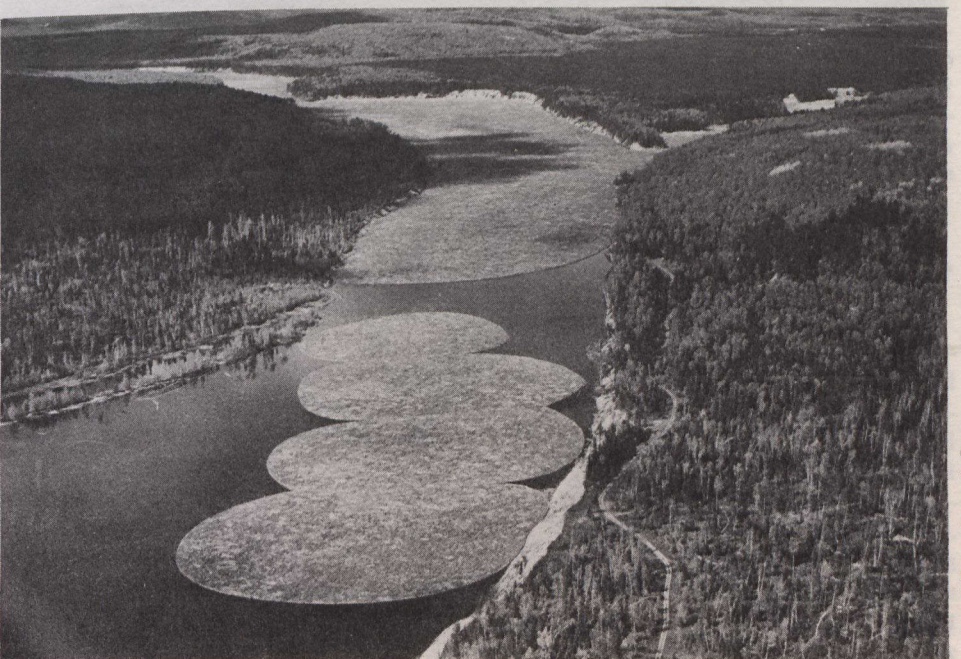
Log booms on the Gatineau River near Ottawa, on their way to the sawmill.

In forest management, the Federal Government is now spending about $43 million a year through agreements with Newfoundland, Nova Scotia, New Brunswick, Quebec and Ontario. This is expected to rise in the next fiscal year as a result of the budgetary re-allocations an-