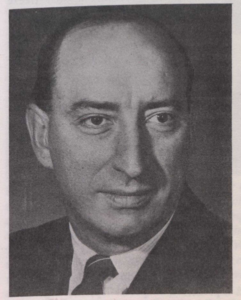
Marc Lalonde, Minister of Justice.

Outlining the origins and prospects of the Canadian unity question, Mr. Lalonde