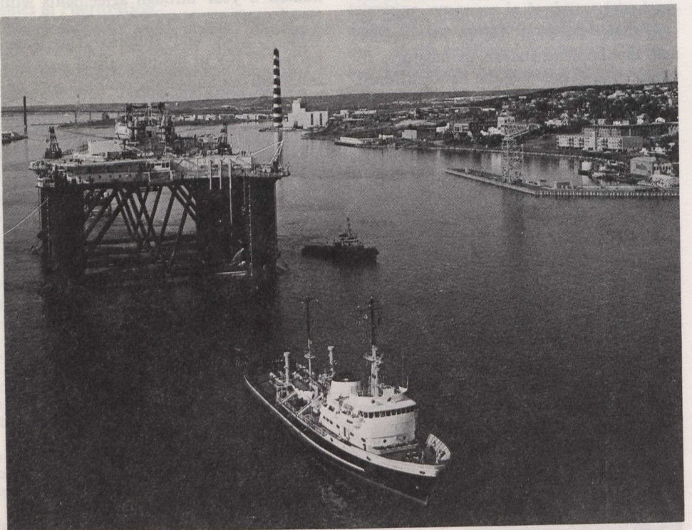
Halifax Shipyards Division of Hawker Siddeley Canada Ltd. builds ships like Stadril (above), which moves through Halifax harbour in Nova Scotia. It is a semi-submersible offshore drilling vessel. Some of the yard's rigs are at work in the North Sea.