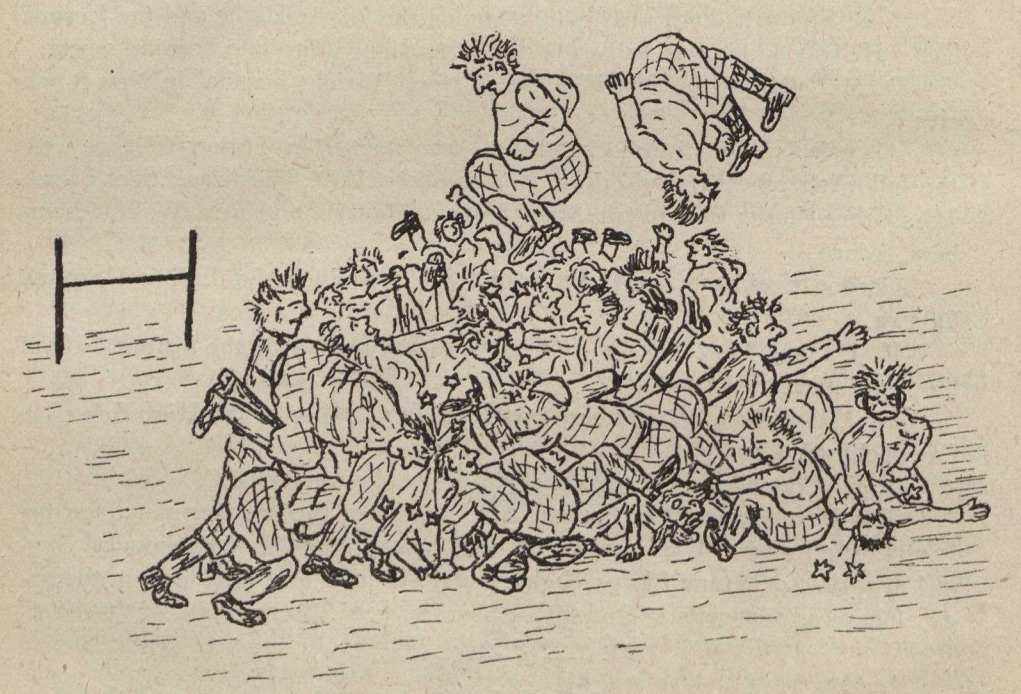
Football has been rather a mix-up this season.