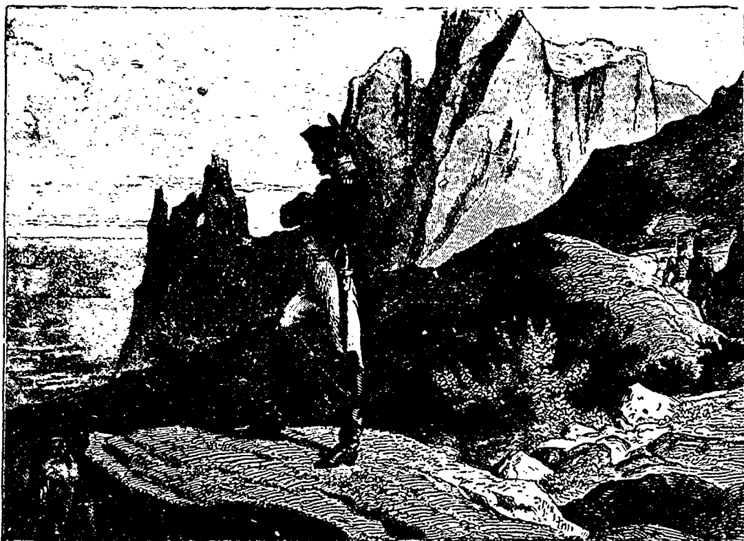
“NAPOLEON AT ST. HELENA.”