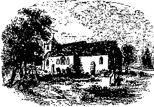
ST. MARTIN'S CHURCH, CANTERBURY.