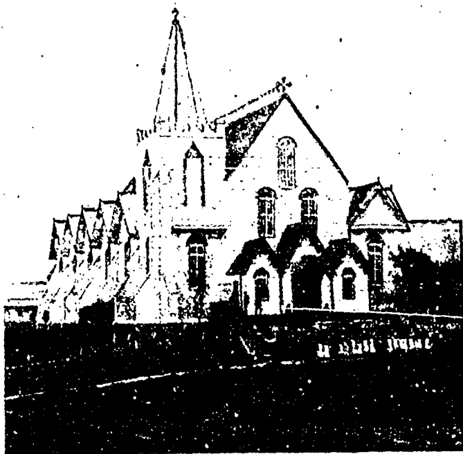
THE CATHEDRAL CHURCH, METLAKATLA, B.C.