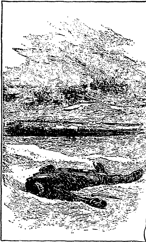
"LOST IN THE SNOW."

a hut about eight miles away, in another direction, where a poor man lived. To this they turned their course and reached it nearly worn out and frozen. It was a wretched little hut, but how glad they were to get there! They could not have held out much longer, and they would soon have all perished in the snow. And this sometimes happens. A Newfoundland clergyman was called, not long ago, to visit a dying man, who lived across a large bay that was frozen over. He reached the house safely and prepared the dying man for death, little thinking, perhaps, that his own death would occur first. But such was the case. He was overtaken by a storm and perished amidst the snow, where his frozen body was afterwards found. In cold winter weather we should not forget to pray for those who may be in the midst of dangers such as those we have now mentioned. It is a noble thing for men to risk their lives for Christ's sake, and it will be lovely for them to hear his beautiful words at the last, "Well done, good and faithful servant."