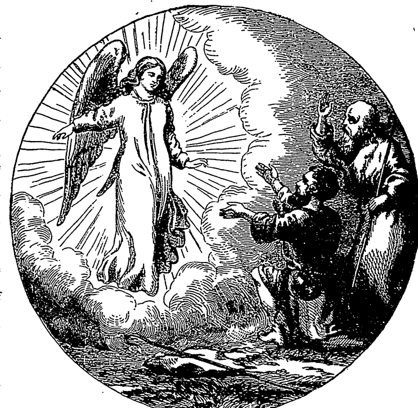
THE FIRST CHRISTMAS.

"Behold I bring you glad tidings of great joy."