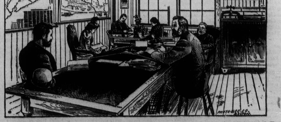
BUSINESS OFFICE, SKODA DISCOVERY COMPANY, WOLFVILLE.

The great success of the Skoda Remedies in the United States and the frequent calls for them in the Dominion necessitated the stocking of a company and the building of a laboratory in Canada. To this end, the trade mark and name of the remedies were copyrighted by the Dominion government, and in January, 1892, a stock company was organized in Wolfville, Nova Scotia, for the purpose of placing these remedies before the Canadian people. The stock was readily taken by phys-