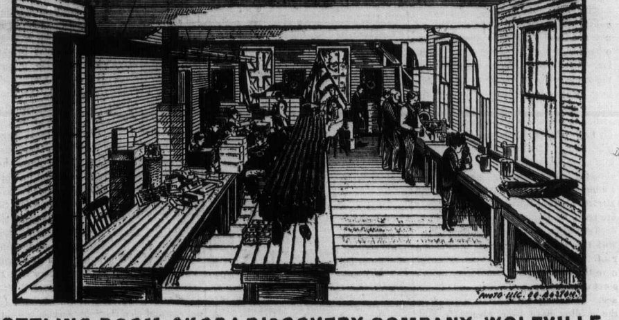
BOTTLING ROOM, SKODA DISCOVERY COMPANY, WOLFVILLE.

This was written some twenty years, or more ago, but to-day the picture is in many respects improved. In Wolfville, one of the towns in this fair and fertile region, is the home of the Canadian Skoda Discovery Company, where most of the stock is owned. The laboratory at Wolfville, a cut of which is here given, is 70 feet long, 45 feet wide and four stories high,