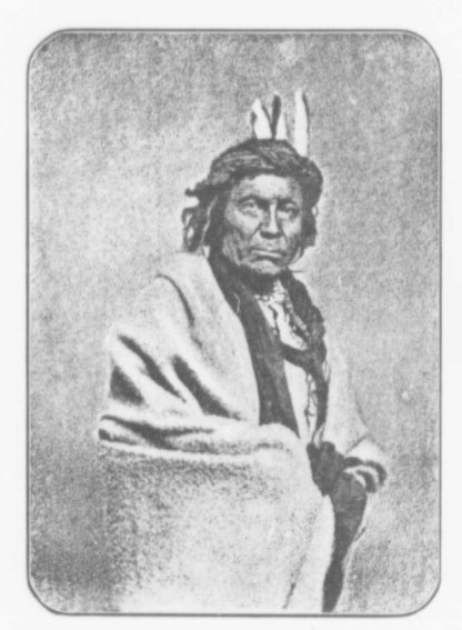
Ojibway Chief, Showing the Racial Characteristics.