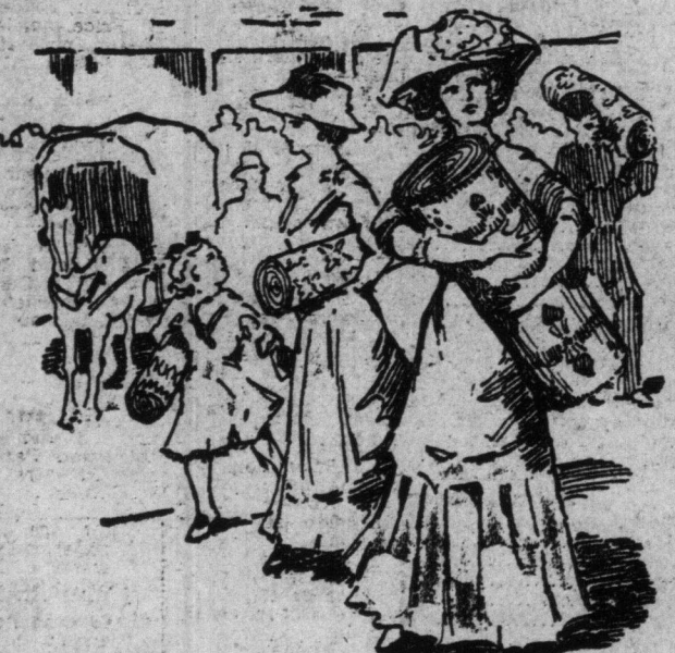
beautiful patterns and colors are features in these excellent floor coverings, for use all the year round. Look and wear better than many a rug costing more.

Twist Weave Rugs are handsome, desirable and artistic rugs, made from all-wool yarn and pure rope stock. Two-toned effects in many