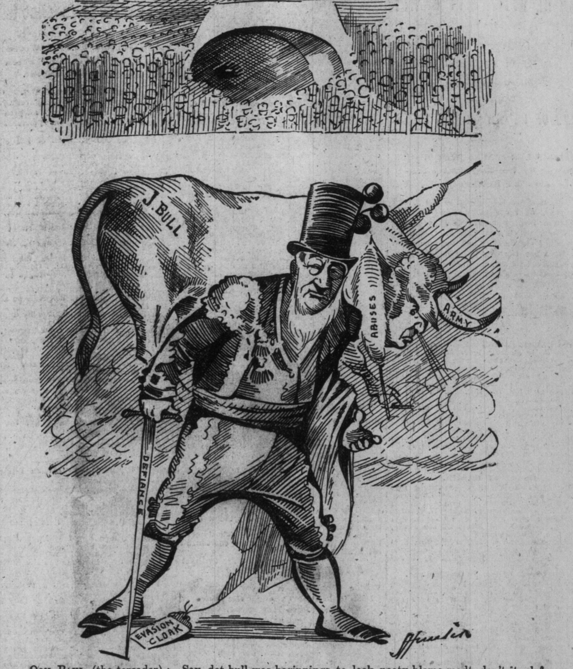
COM PAUL (the toreador): Say, dot bull was beginnings to look pooty blame madt, don't it, eh?