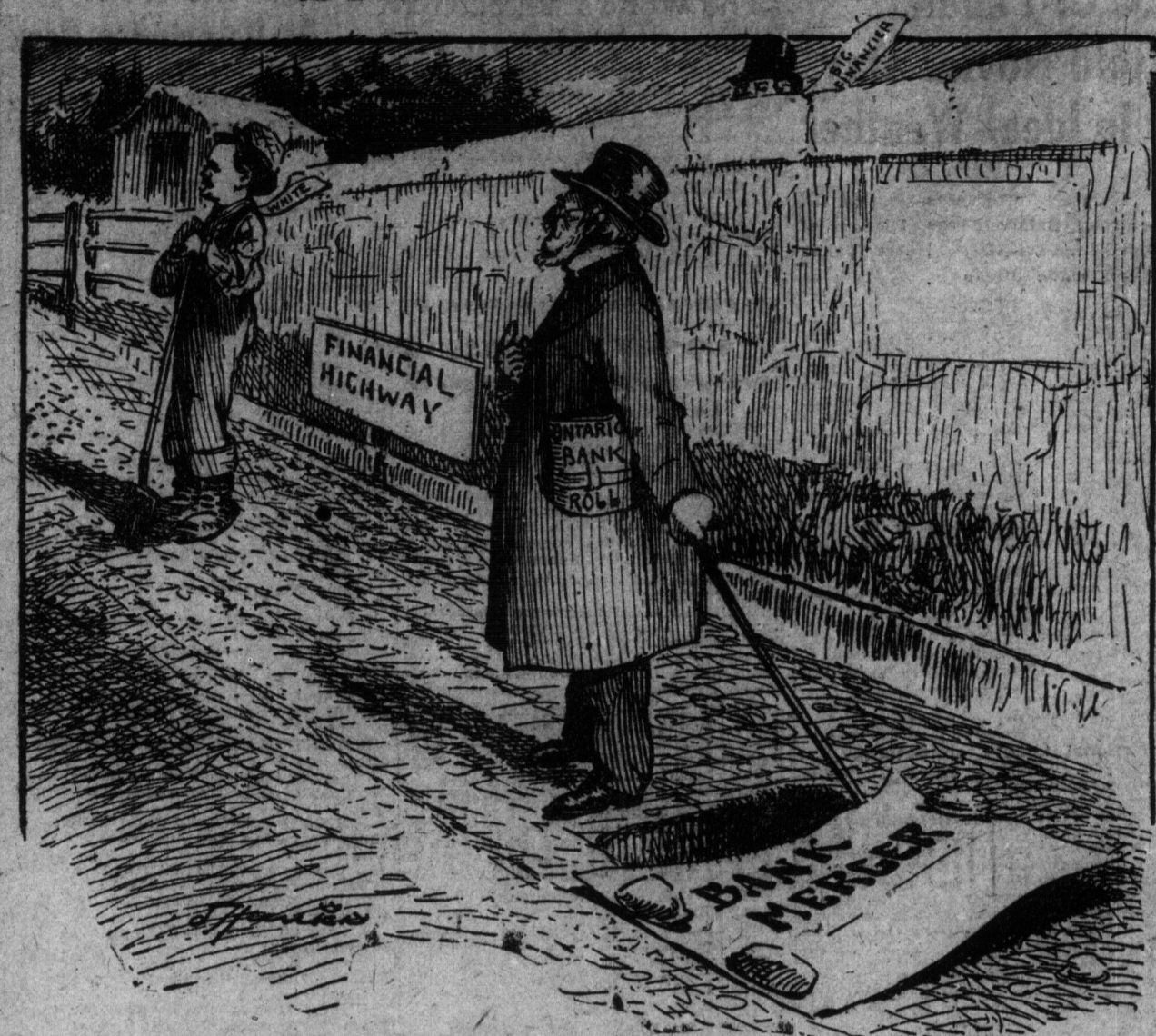
OLD MAN ONTARIO: Look here, Mr. Pathmaster, better see to this hole. All our banks will be falling in.