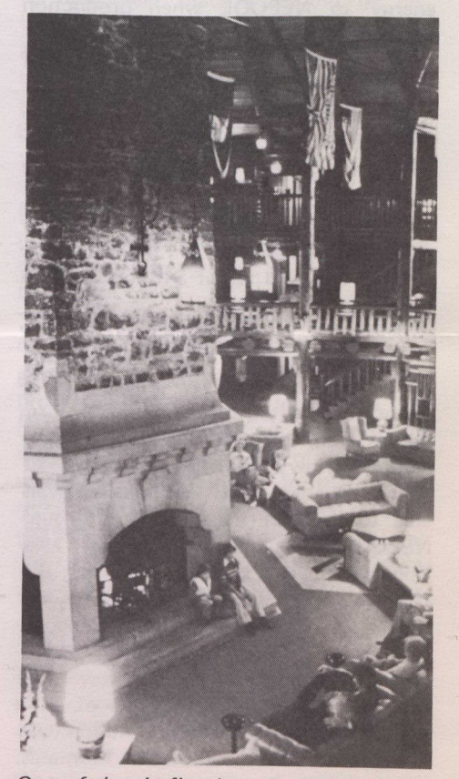
One of the six fireplaces in the hexagonal tower extending nearly 21 metres from floor to ceiling in the main entrance hall of the Château Montebello.

In many places, the craftsman's touch is evident. On the oak staircase leading up