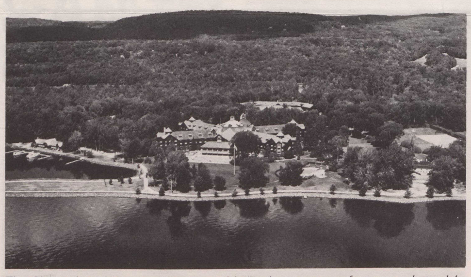
The Château's various recreational amenities and creature comforts are enhanced by their spectacular setting.

The actual building of the facilities took place in record time with July 1, 1930, the sixty-third anniversary of Confederation, chosen for opening day. Excavation