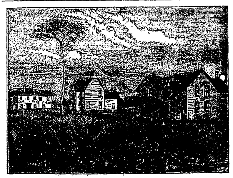
EMMANUEL COLLEGE, DIOCESE OF SASKATCHEWAN.

When these vessels have been gathered, the secretary should credit each class with the amount of its gifts, and then empty them upon the plate or alms-basin. At some fixed time in the Sunday school service, they should be reverently placed upon the table by the superintendent, the whole school meanwhile rising and singing some words suitable to the act.