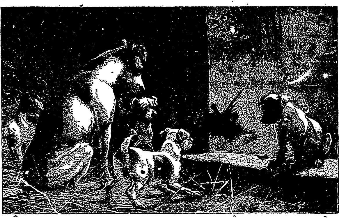
A DISGRACE TO THE FAMILY