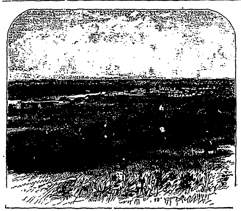
PRINCE ALBERT, DIOCESE OF SASKATCHEWAN.

come us. On our way we had passed through Fort McLeod and had admired the Church, whose tall spire, and surmounting cross is a landmark visible for many miles over the prairie.