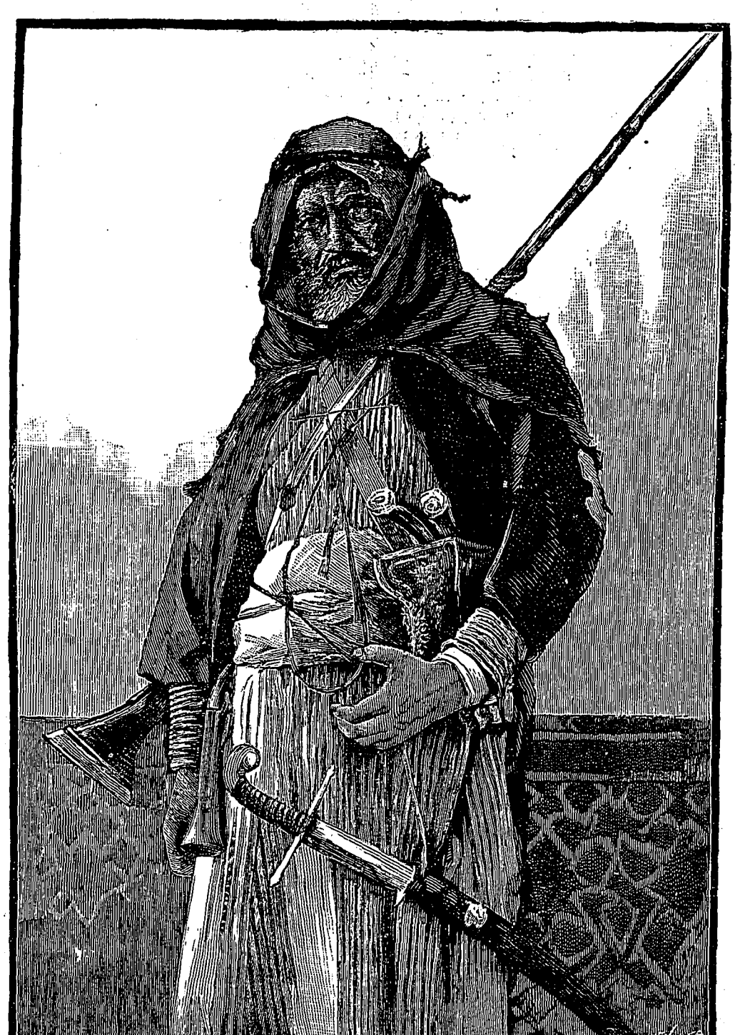
AN ARAB SHEIR.

"Before we begin," said the guide, "I must tell you what I promised. Everything that there