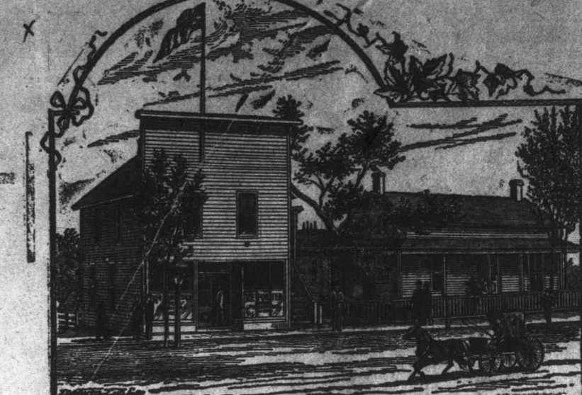
THE HOME OF THE ATHENS REPORTER