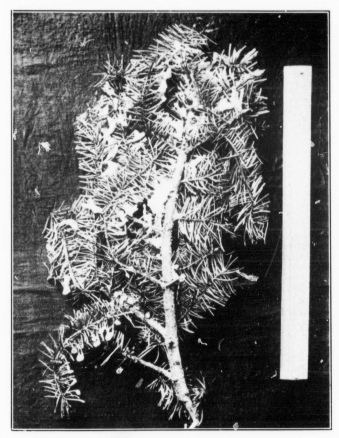
Branch of Douglas fir laden with white masses of sugar. (From B. C. Bot. Office Rep., 1914).

The sugar appears as white masses varying in size from \frac{1}{4} of an inch to \frac{1}{2} or 2 inches in diameter. The smaller masses are formed like white drops at the tips of single leaves, occasionally two or three