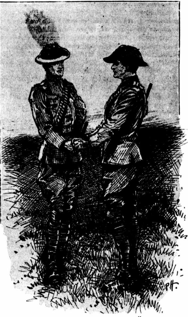
"THE TWO MEN CLASPED HANDS."

"Yes, but I think it will be worse to-morrow," returned Horace. "When these crafty Boers retreat, they often turn up in a more dangerous place for the attack. Still, whatever it is, we shall meet it."