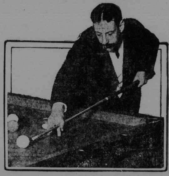
ALFRED DE ORO.