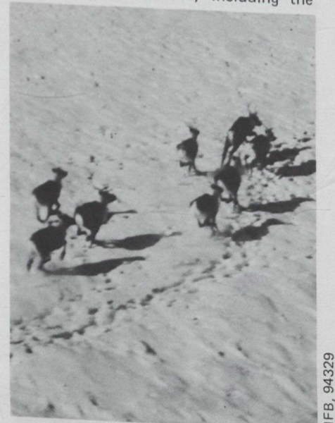
St. John's caribou are popular tourist attraction.

The peninsular supports more caribou for each square kilometre than any other area of North America, including the