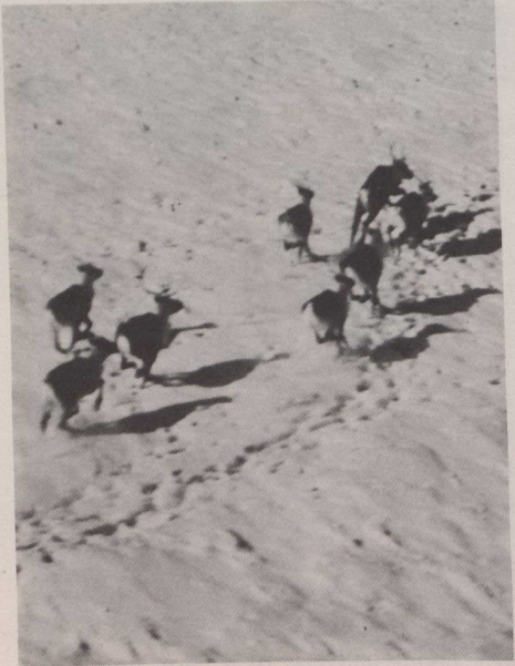
St. John's caribou are popular tourist attraction.

The peninsular supports more caribou for each square kilometre than any other area of North America, including the