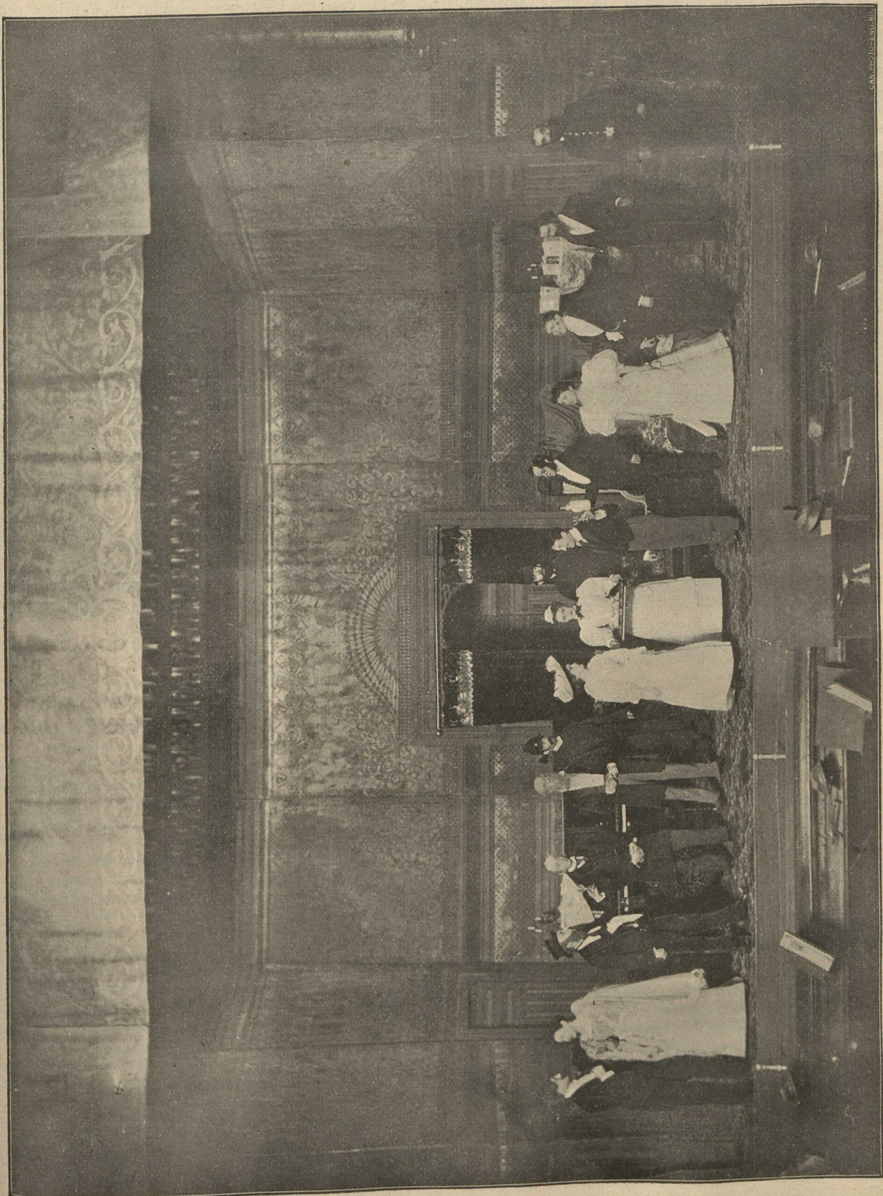
From "The Globe."