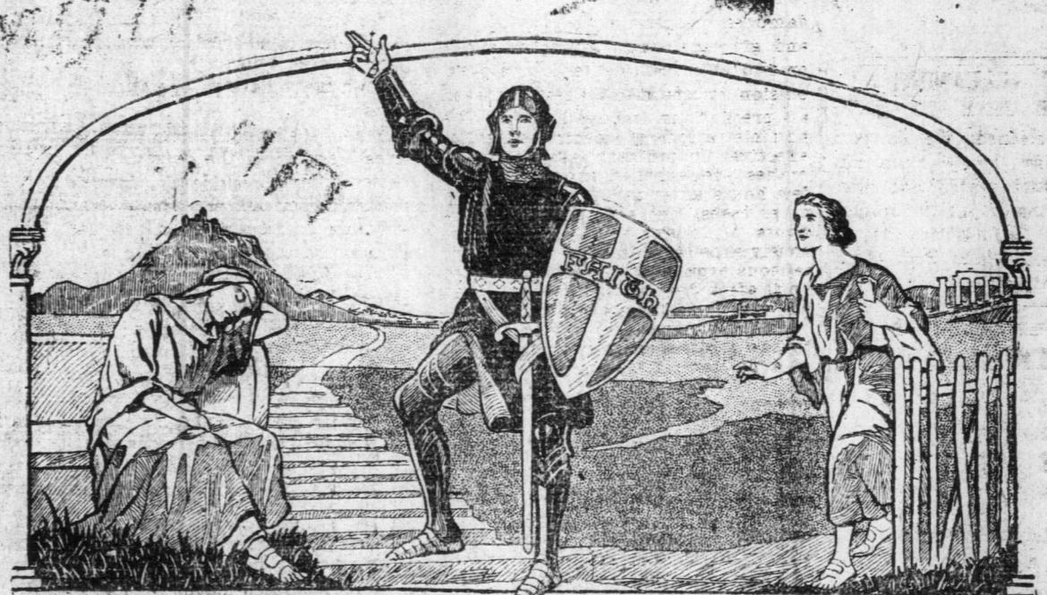
Right the Good Fight

The great non-Christian peoples of the world comprise two-thirds of the human race. They are mastering our modern scientific knowledge, and if they remain Pagan may yet turn it to our destruction. Paganism stands for the supremacy of Might, the very ideal