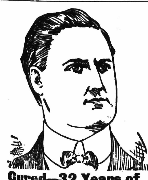
Cured—32 Years of Awful Pile Agony.

"Once upon a time, a very long time ago," her mother began, "a good man wrote the description of a strange and horrible sight which he saw. In a massive wall, he found a door which opened into a secret chamber, whose walls were painted with pictures of