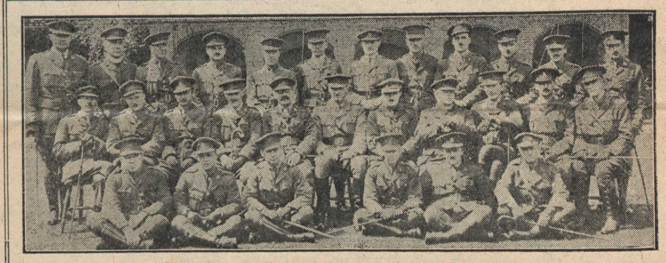
THE GRANVILLE OFFICERS.

"O' course, I says to 'im afore he went away, 'Erb, I says, don't you go a-playing any larks wi' they there French 'ussies, I says, cos I remember right well the ass 'ee was a walking out of Lizzie 'Oskins. I knows what 'ee gets up to when 'ee gets took like that; why, Lor' bless yer, Mrs. Grubbs, the brass 'ee spent on 'er would a' kept me an' you in two-pennorths fer a month! Why I tells yer, tea an' winkles every blooming night it were, and 'is poor old mother waiting 'ome a-dieing for a