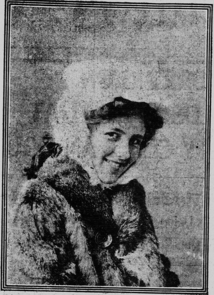
THIS LITTLE GIRL CAME IN A MOTOR. The small maid who motors to dancing class and party there is provided warm coats of the less expensive fur.