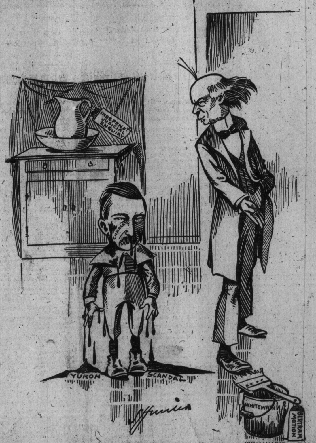
Hear of Tax House? Well, Clifford, so long as you're determined not to wash it off we must apply the white-wash and try to cover it up.

THEY HAVE AN ALLY. The Climate of the Philippines Will Help the Insurgents to Beat the Americans.