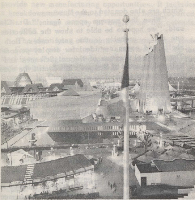
Expo 67, the biggest candle on Canada's birthday cake during centennial year.