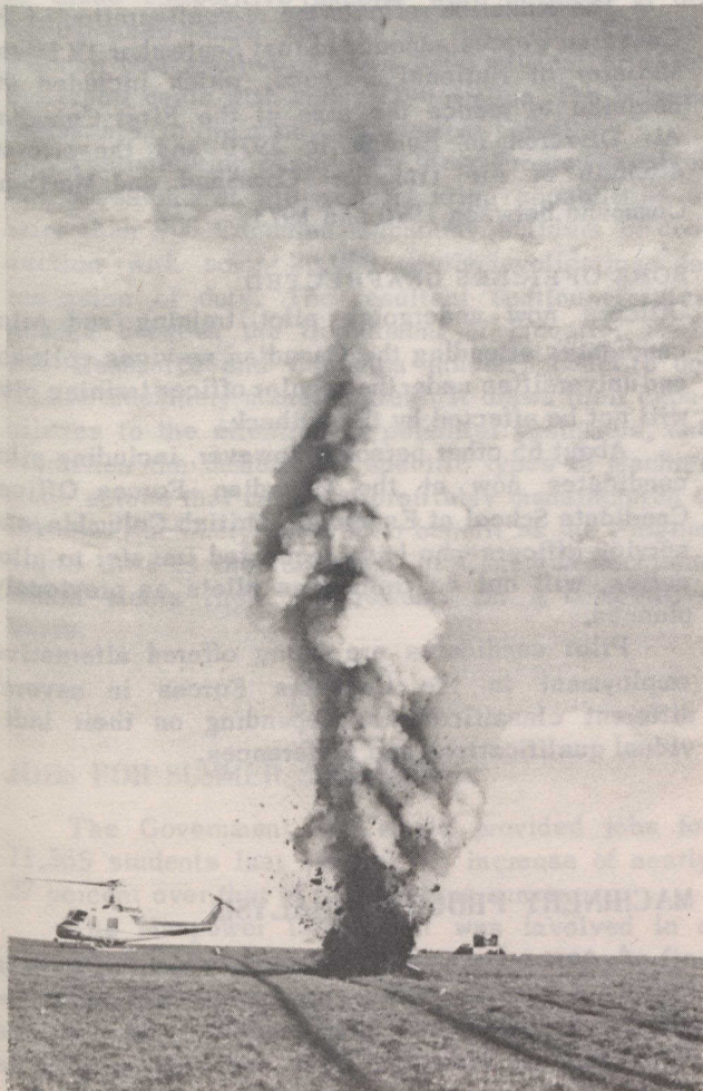
In 1968 the search for oil reached the Arctic Islands and seismic explosions, shown here, were followed by exploratory drilling in 1969.