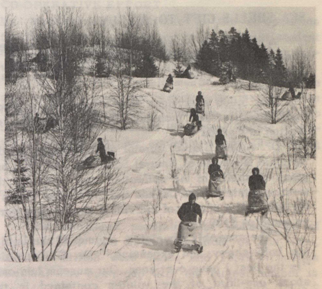
The snowmobile provided Canadians with a new sport during the Sixties and, up north, the machine replaced the dog-sled.