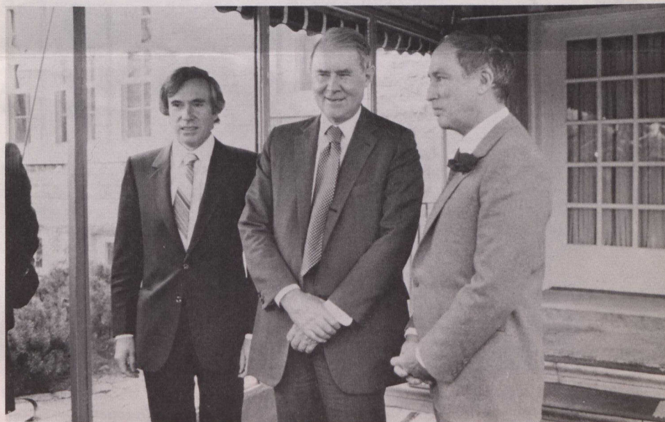
(Left to right) External Affairs Minister MacGuigan, Secretary of State Vance and Prime Minister Trudeau, before their lunch at the Prime Minister's residence.

He cautioned that the estimates are only preliminary but the economics appear sufficiently promising to justify detailed studies.